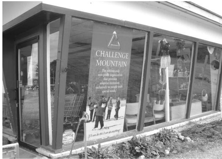
Challenge Mountain Resale Shops, located in Boyne City and Petoskey, offer a wide range of donated clothing and household items for sale with proceeds utilized to help support Challenge Mountains' ongoing mission.

The Boyne City store is located at 1158 S. M-75, just east of Boyne City toward Boyne Falls (where the facility was actually once located), and the Petoskey